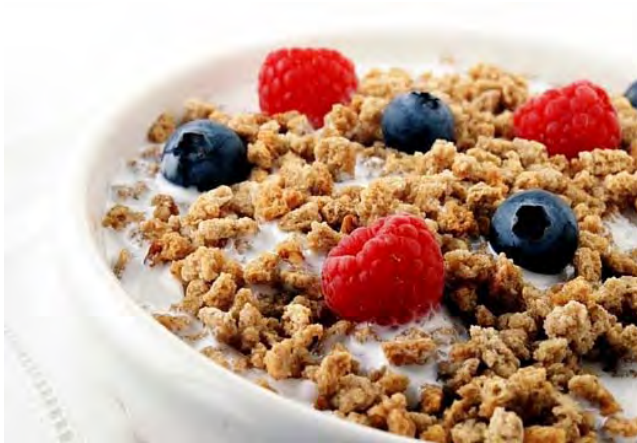
Grape Nuts With Milk