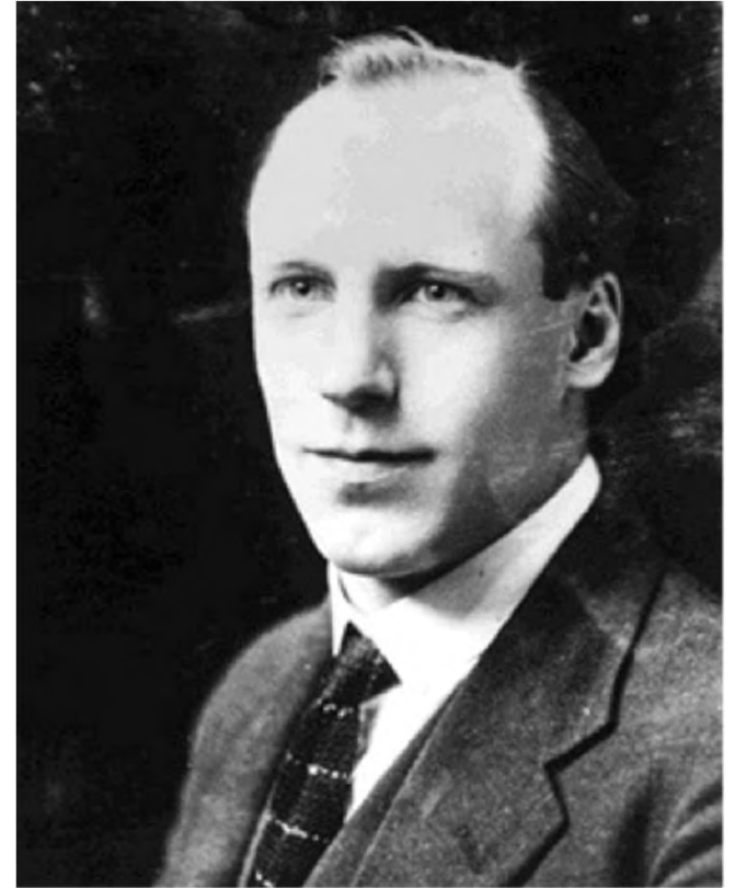
ERIC LIDDELL 1902 - 1945

Christ for the world, for the world needs Christ!