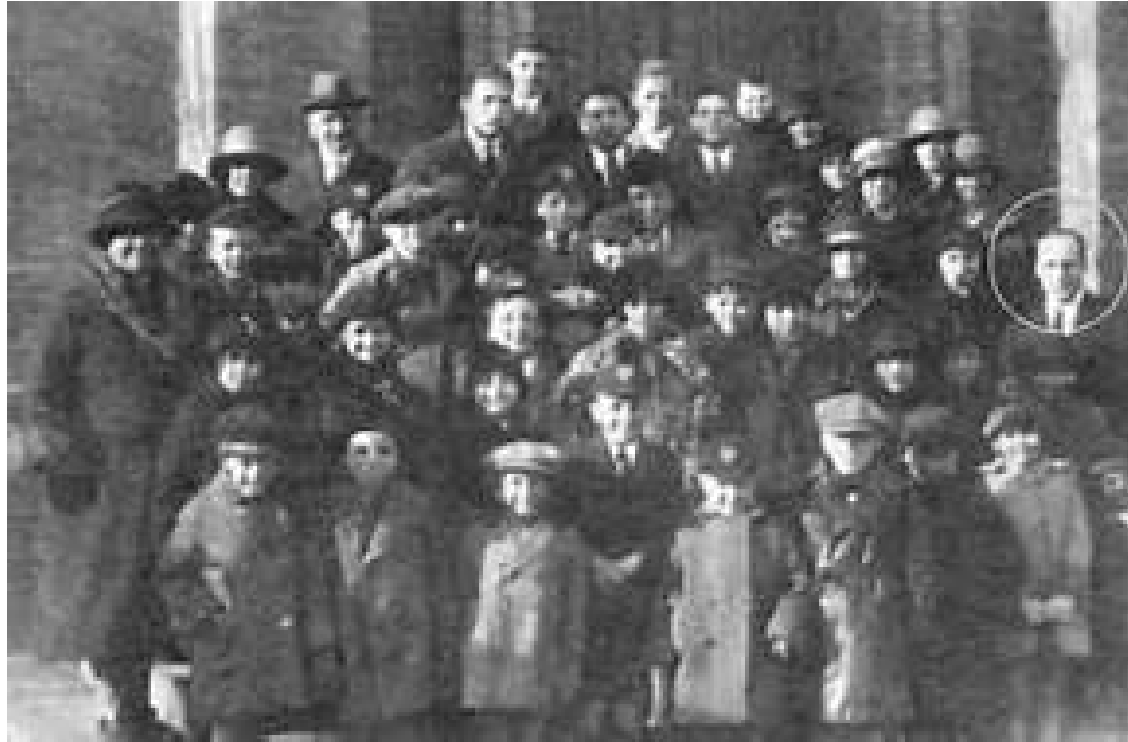
Missionary in China 1924-1945